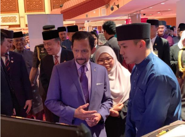
i-Usahawan Programme Contractors / Vendors showcasing their business during the National Youth Day 2019 event