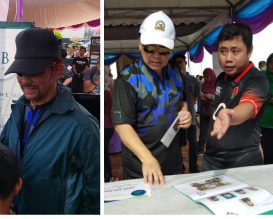
i-Usahawan contractors during Riadah Berbasikal Event 2020 at Bandarku Ceria