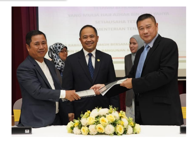
i-Usahawan 1<sup>st</sup> signing ceremony event with Government Department (DES)