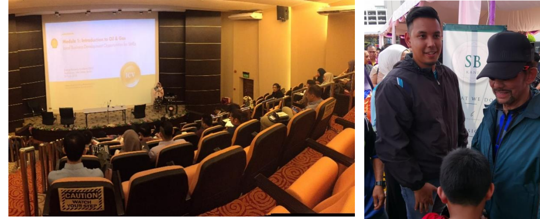
Energy Business Academy held at JobCentre Brunei for BSJV i-Usahawan Participants