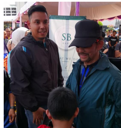
i-Usahawan contractors during Riadah Berbasikal Event 2020 at Bandarku Ceria