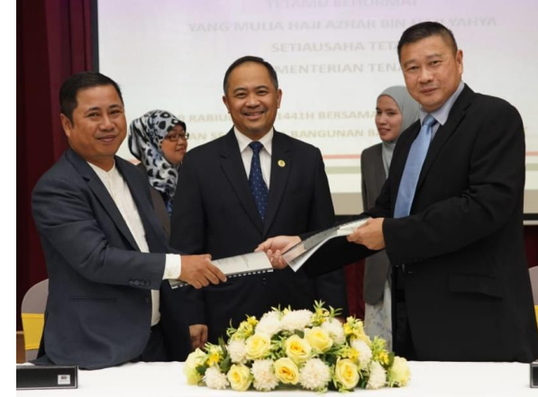
i-Usahawan 1 st signing ceremony event with Government Department (DES)