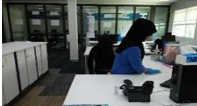
Munch Brunch Canteen Provision of Cleaning Services for BGC Sdn Bhd Awarded: 6th March 2019 Locals: 7