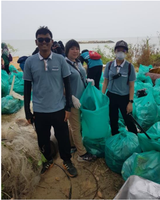
Mortar Sdn Bhd Provision of Event Management Services for BGC Sdn Bhd Awarded: 6th March 2019 Locals: 8