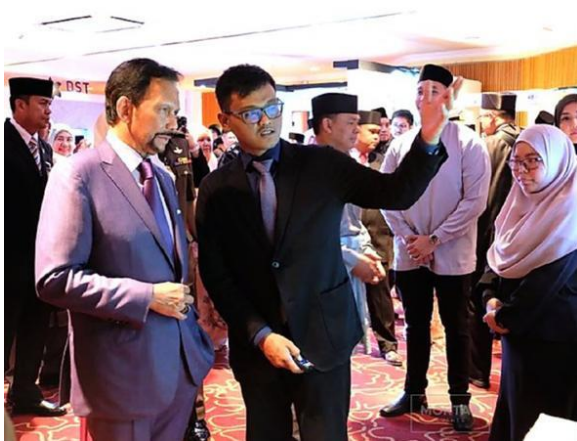
i-Usahawan Programme Contractors / Vendors showcasing their business during the National Youth Day 2019 event