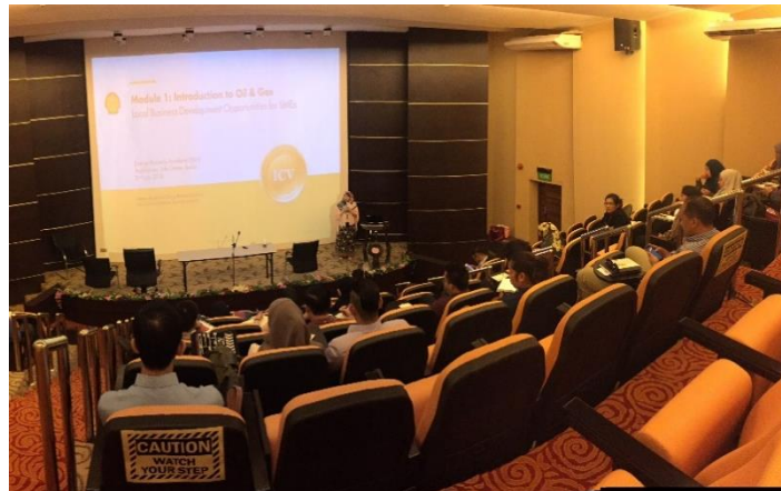
Energy Business Academy held at JobCentre Brunei for BSJV i-Usahawan Participants