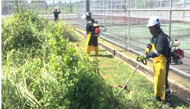
S.B. Kani Company Provision of Grasscutting, Ditch Cleaning and Re-grading Services for Non-hydrocarbon areas for BSP Sdn Bhd Awarded: 27th May 2019 Locals: 56