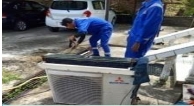
Mohd.HMS Enterprise Provision of Air Conditioning Serving and Maintenance Services for TOTAL Sdn Bhd Awarded: 29th August 2019 Locals: 3