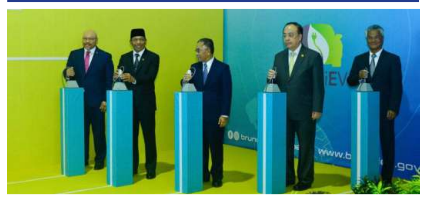
A two-year Pilot Project on Electric Vehicles was successfully launched on 25th March 2021 as part of a multi-sectoral approach for a low carbon and climate resilient future in support of the Brunei Darussalam National Climate Change Policy (BNCCP)

As part of the initiative to support Strategy 3: Green Energy of Ministry of Energy's Strategic Plan 2020-2025, a two-year pilot project on Electric Vehicles was successfully launched on 25th March 2021.